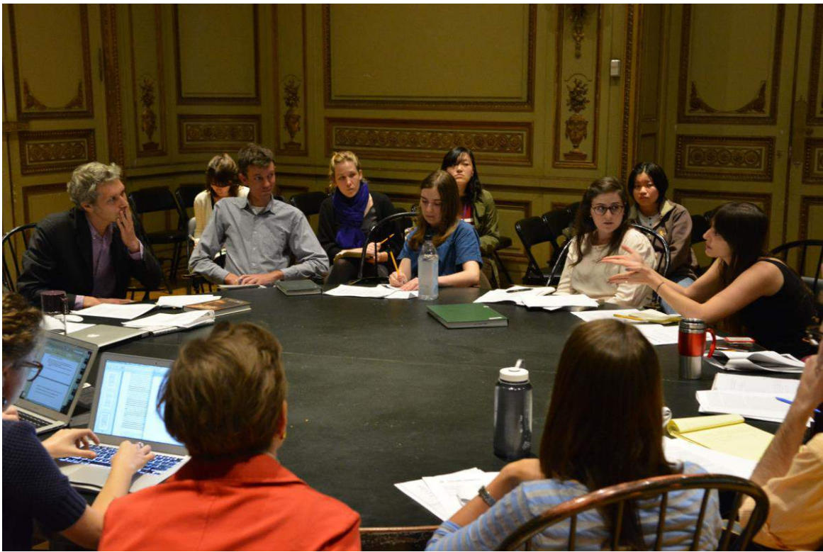
Mellon Student Reading Group meeting