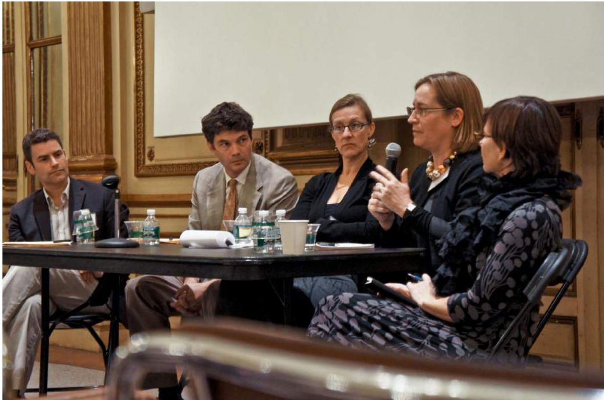
Publishing and the PhD public workshop

in December 2012 , addressed the rapid changes in the field of conservation; global exchange; resource-sharing among the various training programs; conservation needs in U.S. museums; educating conservators of electronic, modern media and contemporary art; the lack of diversity in the field; and the nature of applicants to conservation programs. The final meeting in February 2014 brought together representatives from each of the four American graduate programs in art conservation to discuss the sustainability of the models of their educational systems, and current and future curricula.