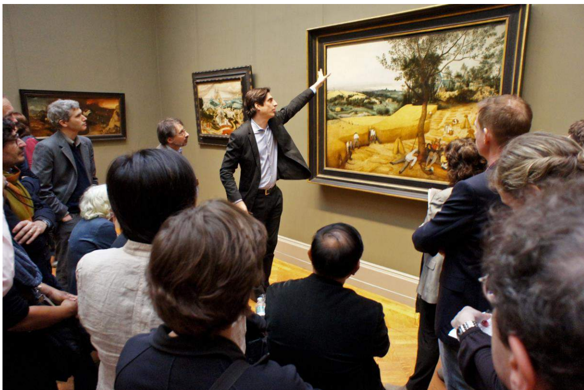
Participants in the conference Comparativism in discussion at the Metropolitan Museum of Art