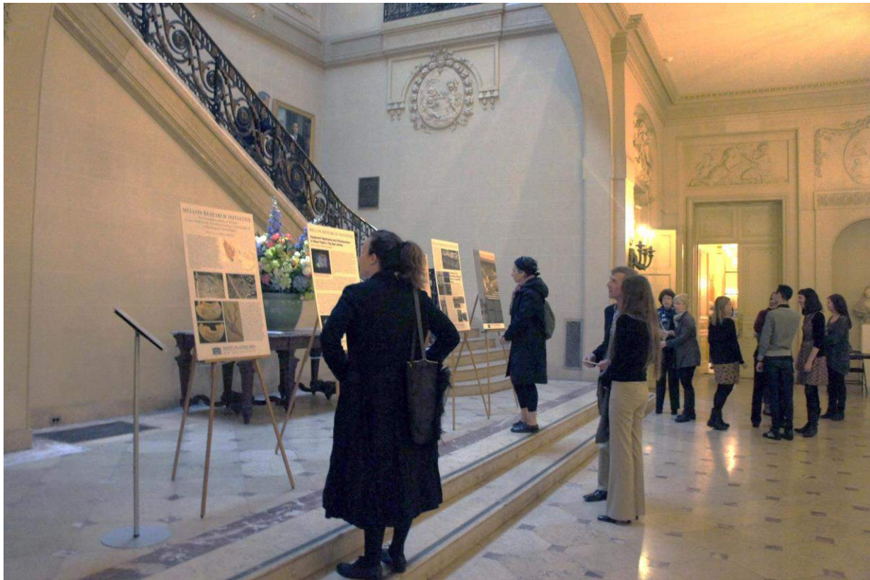
Poster presentations at the conference Archaeology, Heritage, and the Mediation of Time

https://www.nyu.edu/gsas/dept/fineart/research/mellon/mellon-video-archive.htm