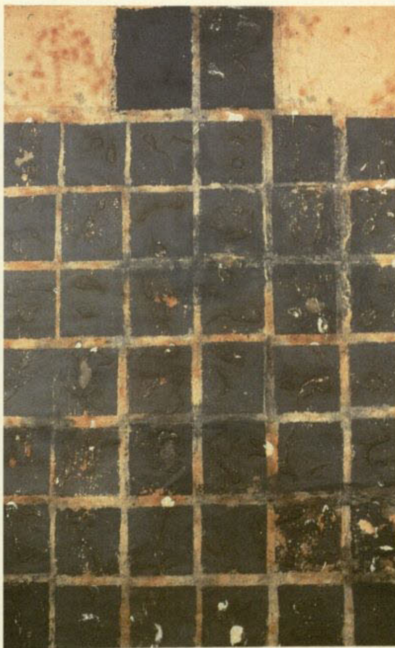
Hou Wenyi, Couple Stele , 1996. Ink and blood on paper and fabric, each panel 56" x 36" (142 x 91.5 cm).