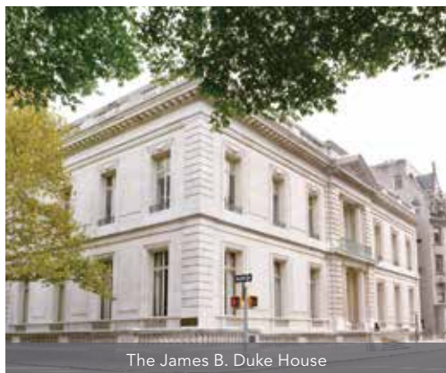
The James B. Duke House

Connoisseurs Circle members have the opportunity to rent the Institute of Fine Arts' historic home, the James B. Duke House, on the Upper East Side of New York City. Whether it is an intimate dinner party in our handsome Loeb Room, a large-scale event in the Great Hall, or a meeting in our Seminar Room, the Duke House provides a unique setting for a wide variety of special occasions. This historic landmark has retained all of the charm and elegance from its inception over a century ago. With many of its original walls, floors, ceilings, and fixtures, your event is sure to reflect the character and atmosphere of the renowned Duke mansion.