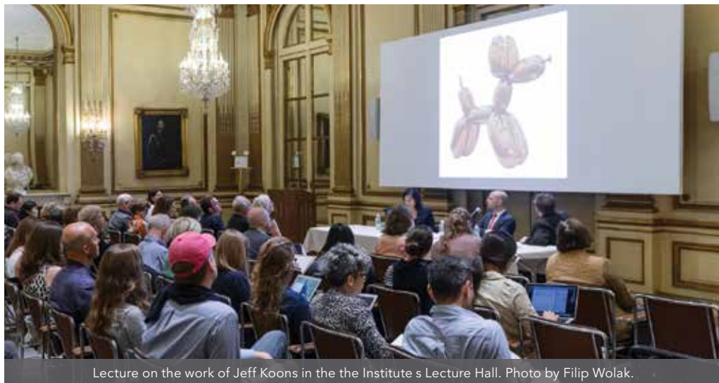
Lecture on the work of Jeff Koons in the the Institute s Lecture Hall.

Members have the privilege of auditing an array of Institute lectures and seminars with its renowned faculty, alongside degree-pursuing students. Each semester offers a range of topics within art history, conservation, and archaeology. There is no limit to the number of courses that members may audit each semester. Recent courses include: