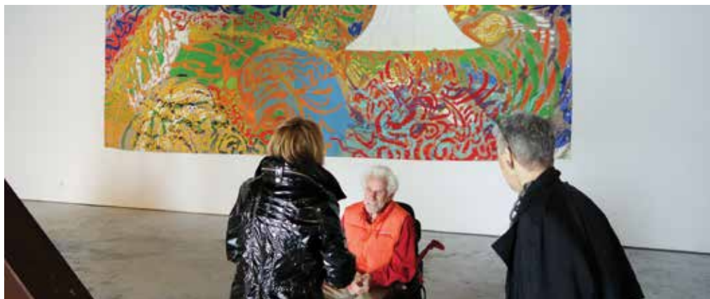
Members visit Mark di Suvero's studio with the artist.

Special art world events designed especially for members are a cornerstone of the Connoisseurs Circle program. From artist studio visits to faculty- and curator-led tours of leading exhibitions, to visits to some of today's finest private art collections, the Connoisseurs Circle offers its members exceptional access to the art world in New York City and beyond. Recent visits include: