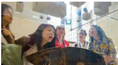
Conservation class visiting The Metropolitan Museum of Art's collection of glass objects.

Current course calendar can be found in the back of this brochure.