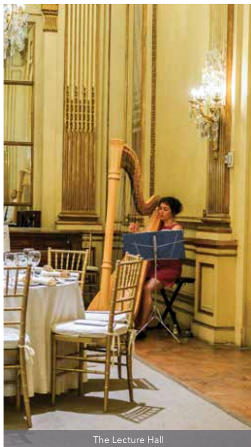
The Lecture Hall