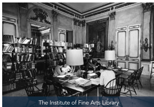
The Institute of Fine Arts Library