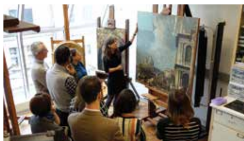
Members visit the Institute's Conservation Center.

Also available to members is the Institute of Fine Arts' Stephen Chan Library of Fine Arts at the Conservation Center, which offers scholarly research sources as well as readings for those courses available for audit.