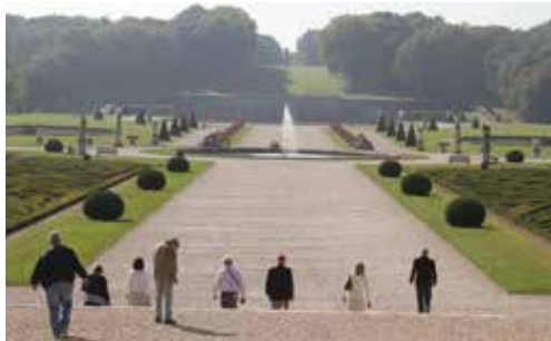
Private tour of Château de Vaux le Vicomte in the Loire Valley.