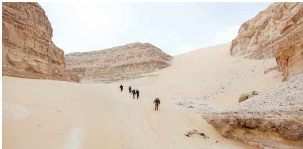
Abydos Excavation, 2014.