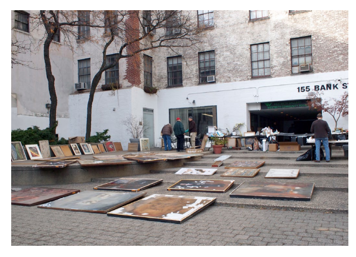
Paintings drying in the Westbeth courtyard