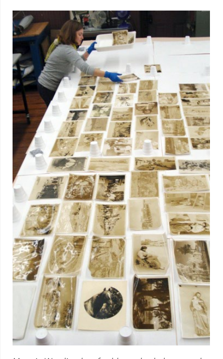
Maggie Wessling lays freshly washed photographs, recovered from a New Jersey coast home, out to air-dry