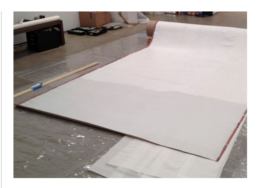
The unstretched painting has been partially rolled onto a new tube, and the damp section rolled out to dry