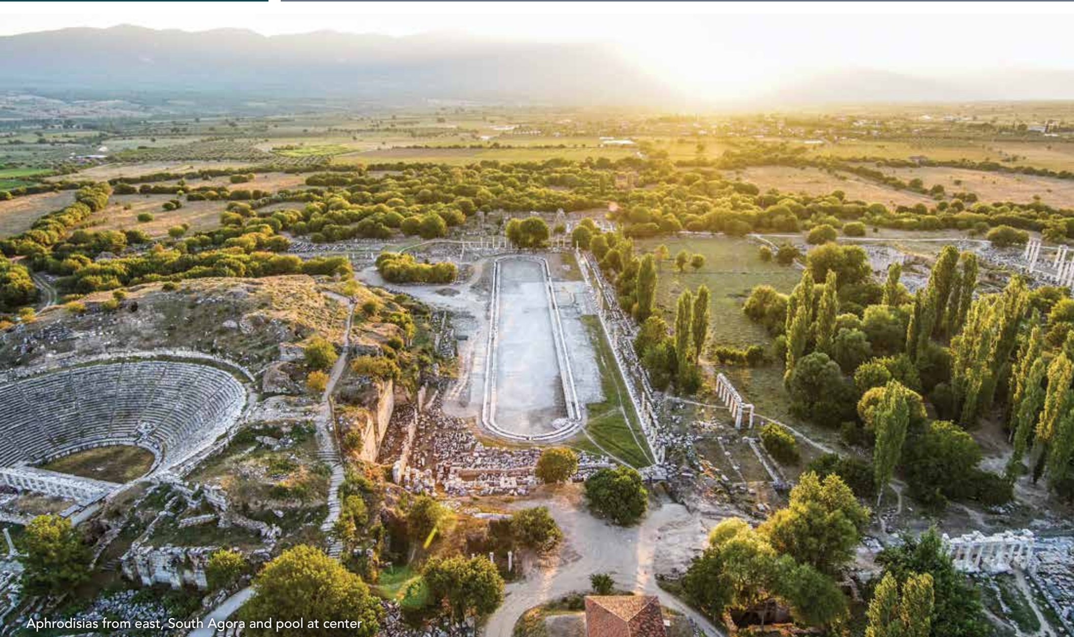
Aphrodisias from east, South Agora and pool at center