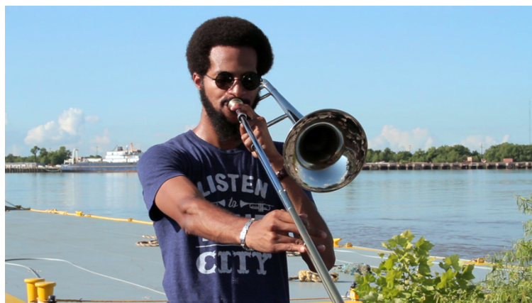
Fig. 3: Cauleen Smith, H-E-L-L-O (video still), 2014. Digital video, 11:06 minutes.

Similarly, H-E-L-L-O presents the jazz musicians performing John Williams’s famed five notes stripped from their orchestral collective, as a set of solo pieces that emphasize the call to be seen and understood. The questions of visibility and presence mapped through the phantasmagorical performances across nine locations in New Orleans motion towards an acknowledgement and consideration of the marginalized in the city—most urgently displaced and disenfranchised Black communities. Although the tragic and wide-sweeping devastation of Hurricane Katrina was witnessed by millions in real time, the socio-historic preconditions that exacerbated the storm’s impact as well as its long-term ramifications across industry and culture remain unseen by many. Described as a “natural disaster,” the supposed organic or natural occurrence is a construction that functions similarly to the assumed naturalness of urban topographies.