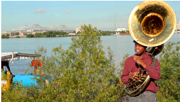
Fig. 1: Cauleen Smith, H-E-L-L-O (video still), 2014. Digital video, 11:06 minutes.

recognizable font of the science fiction genre, the greeting registers as belonging to the extraterrestrial or unknown realm of the cosmos. Then lowering her lens from the boundless sky to the ground, Smith focuses on a crane in a New Orleans shipyard—a symbol of the city’s industrial history and continued quest for regrowth after natural devastation. A bass-clef score accompanies this visual descent. This rich five-note sequence, sourced from the sci-fi 1977 cult masterpiece Close Encounters of the Third Kind (Smith’s title font also nods to its Spielberg predecessor), riffs throughout the film as a constant but contingent score. The nine musicians introduce their own vital interpretations of the set score, forging sonic as well as scenic movement.