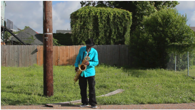
Fig. 4: Cauleen Smith, H-E-L-L-O (video still), 2014. Digital video, 11:06 minutes.

are buried, before returning to a liminal boundary along Mississippi River. Although Smith's